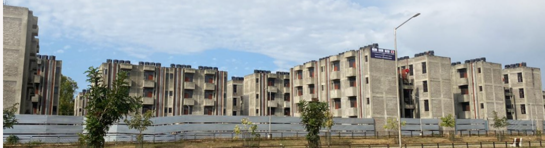
ARHCs Houses in Maloya, Chandigarh

Till now, 29 States/UTs have signed a Memorandum of Understanding (MoU) for ARHCs. The sub-scheme is a major step forward towards providing Ease of Living to Urban migrant/poor by giving them access to dignified living close to their workplace. It is in line with the Hon'ble Prime Minister's clarion call of 'AtmaNirbhar Bharat'.