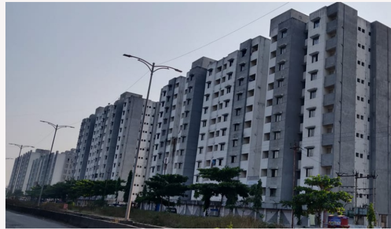
ARHCs Houses in Surat & Rajkot, Gujarat

On June 14, 2020, the Union Cabinet approved the Affordable Rental Housing Complexes (ARHCs) sub-scheme under the Pradhan Mantri Awas Yojana-Urban (PMAY-U) for the urban migrants/poor. They come to cities for employment opportunities and need decent rental housing in affordable rates close to their work places. In order to address this need, the Ministry of Housing & Urban Affairs (MoHUA) initiated the ARHCs. Gujarat and the Union Territory of Chandigarh have become the first movers in this regard. RFPs have been issued for ARHCs in Surat and Rajkot.